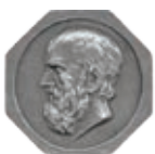
SCHOOL OF MEDICINE, ARISTOTLE UNIVERSITY OF THESSALONIKI